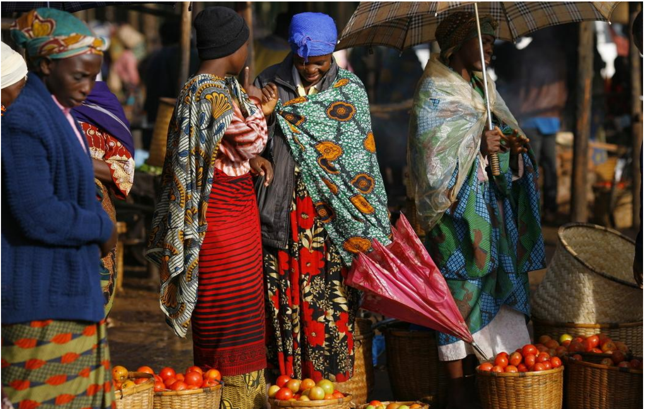
Bvumbwe market, Malawi, 2009; improved irrigation makes tomatoes a successful crop for a farmers' cooperative.